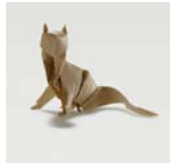
Keep an eye on the big picture: SIPAPER CS DCS and SIPAPER CS QCS

SIPAPER CS Reject Power is the solution to counter constantly rising energy and waste disposal costs. Paper production waste (including sewage sludge, wood waste, etc.) is processed into a fuel mix and burned, generating energy. The resulting steam can be used in paper production or converted to electricity using a cogeneration system. You'll be amazed at how much your waste is worth!