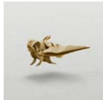
Fast, reliable, efficient: SIPAPER ci5 Services