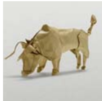
The energy bundle: SIPAPER CIS Power

From winders to complex paper roll slitters, SIPAPER CIS Winder is the ideal drive solution for new or modernized finishing machines. A modular system structure, numerous integrated interfaces, and powerful drives based on the SIMATIC S7, the world's leading automation platform – that's how compactly we can bundle expertise in a single product!