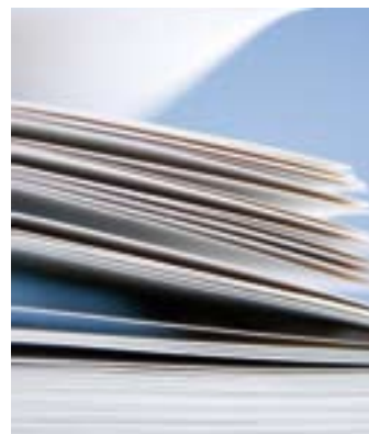
The requirements of the paper and pulp industry are as far-ranging as the modules in our product line