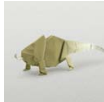
And the color is perfect: SIPAPER ci5 APC

Play it safe: SIPAPER ci5 Services guarantees plant availability over the long term. Here as well, we utilize the in-depth technical knowledge of our employees and their many years of experience from many service calls and maintenance projects in a wide variety of plants. Our primary focus is always on each customer’s specific requirements and business goals.