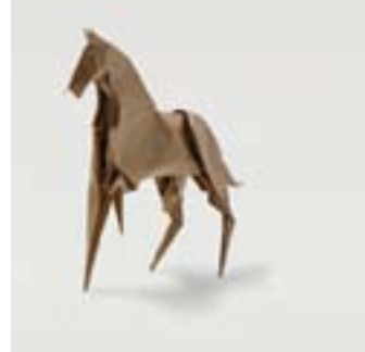
The drivers of your success: SIPAPER CIS Drives and SIPAPER CIS Winder