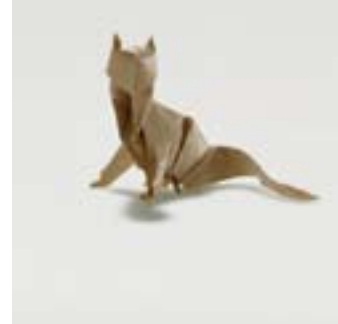
Ensures clever connections: SIPAPER ci5 IT