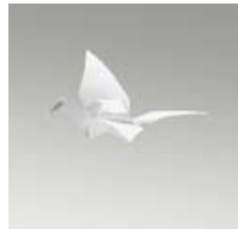
It'll send you soaring: SIPAPER CS Water for SIPAPER CS Reject Power